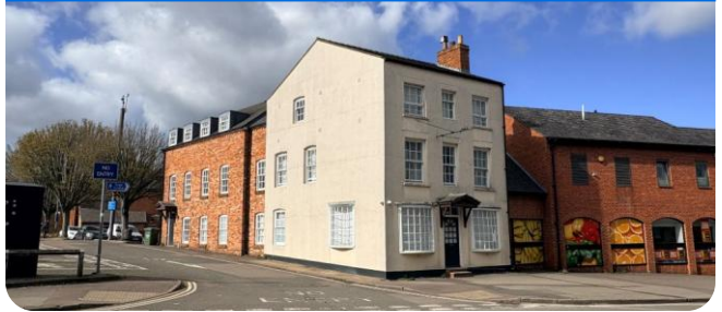
Globe House 55 Calthorpe Street