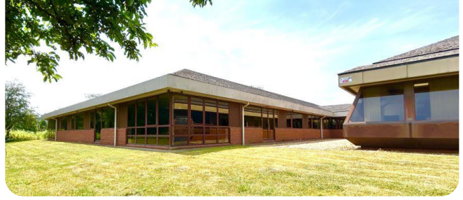
Former Innoval Building, Beaumont Close