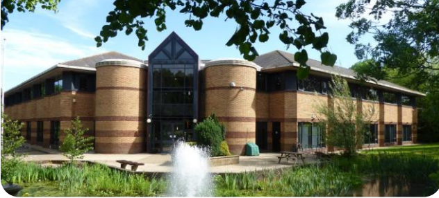
Pembroke House, Adderbury