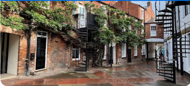
2B White Lion Walk