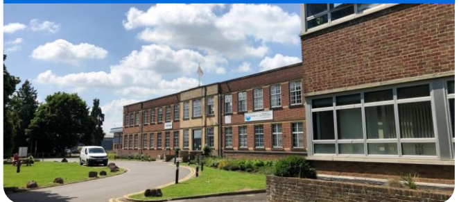
Cherwell Business Village, Southam Road