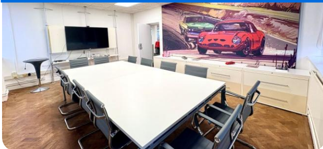
G103-110 Cherwell Business Village