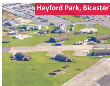
Heyford Park, Bicester